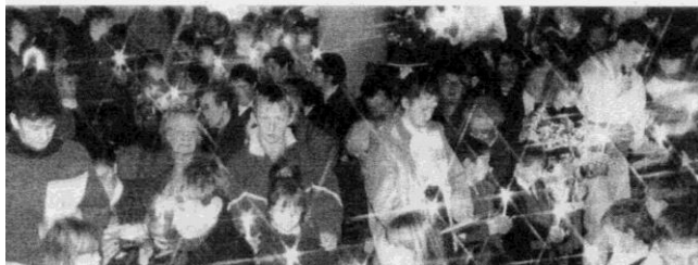
The choir sings "O Holy Night" by Adam

Please move forward as directed to collect a Christingle