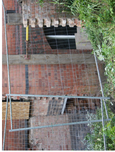
View of the site from the Vicarage Garden

Excavation and breaking through is well under way in preparation for building the extension (to be called 'The Pavilion' or 'Access Pavilion?') for a lift and staircase leading to new facilities in the Undercroft. The builders' compound severely restricts car parking behind the church. Members of the congregation are encouraged to make use of the car park behind 218 London Road , next to the Vicarage, leaving the forecourt of the Vicarage available for frail or disabled drivers and passengers.